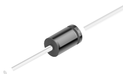
DO-35 Glass case COLOR BAND DENOTES CATHODE