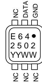
TOP VIEW THE DOT MARKS PIN 1

YYWW = DATE CODE RR = DIE REVISION CODE CCCCC = COUNTRY CODE