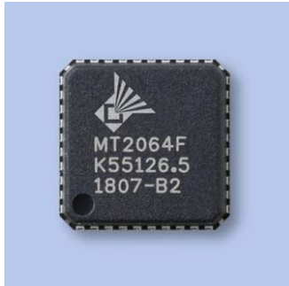
MT2064 Single-Chip Broadband Tuner

The MT2064 is a low-power 3.3V single-chip broadband tuner with an integrated IF variable-gain amplifier.