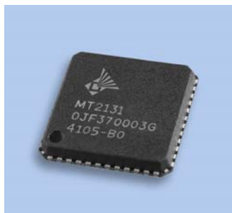
MT2131 Single-Chip Tuner

The MT2131 is a high-performance single-chip tuner for ATSC and Digital Cable-Ready ATSC television receivers and set-top boxes.