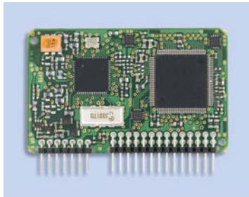
MT1503EDC DAB/DMB Tuner

The MT1503EDC is a high-end tuner module with integrated channel decoding and baseband processing capabilities for terrestrial digital audio broadcasting (DAB). It has been designed to meet the specific requirements of automotive applications.