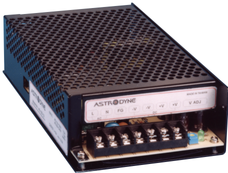
Unit measures 4.4"W x 7.96"L x 2"H