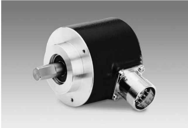
GA210 with clamping flange