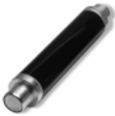
6 / 12KV