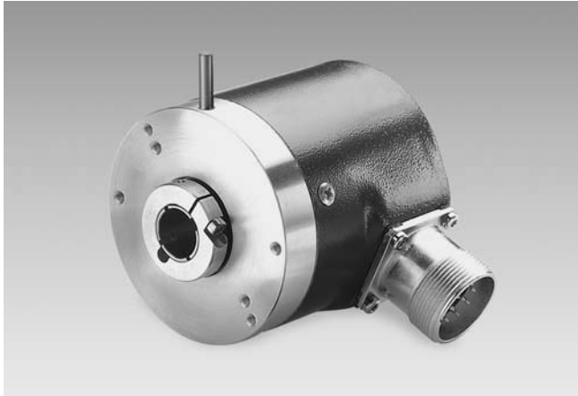
GBP5H with hollow shaft