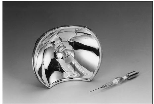
▲ Center : L4342-01, Right : L4342