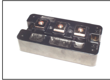
QIQ0630003 Low side Chopper IGBT Module 300 Amperes / 600 Volts