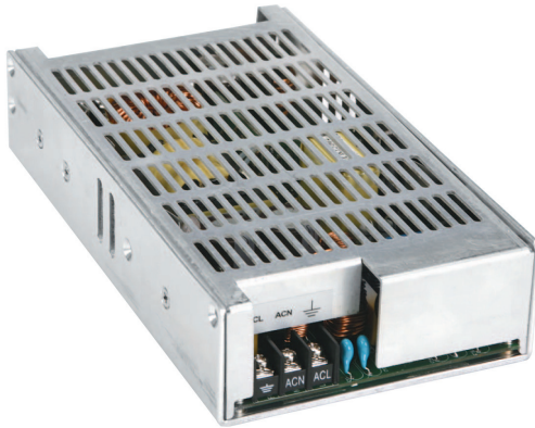
3.86"W x 7"L x 1.57"H