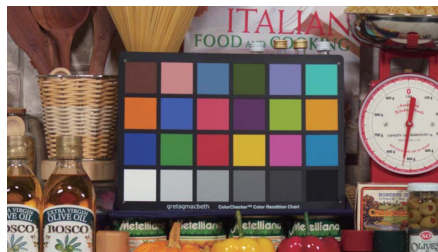
1080p HD mode*1 (1920 × 1080), analog gain: 6 dB

*1 Acquired with center cropping: the optical center is the same as in all-pixel scan mode.