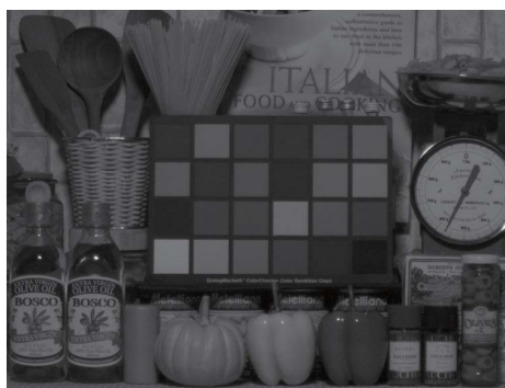
IMX036LLR analog gain: 24 dB