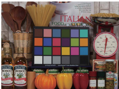
3.2M-pixel all-pixel scan mode (2048 × 1536), analog gain: 6 dB