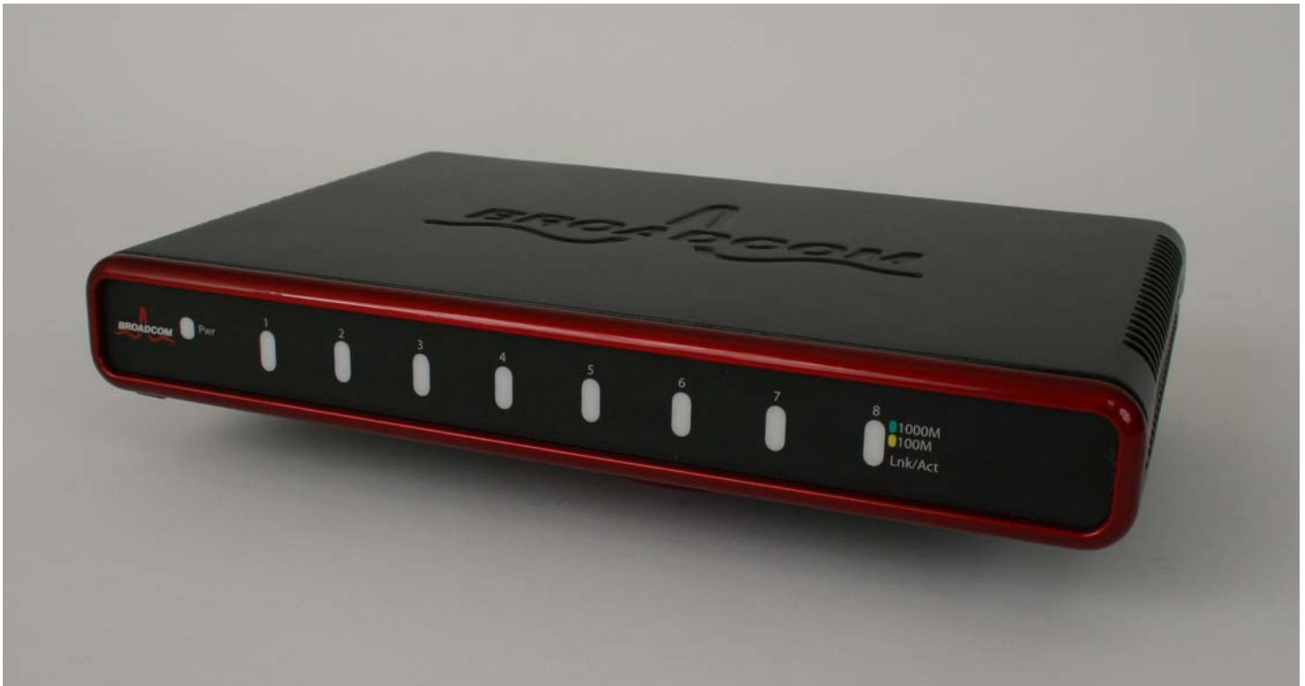
BCM953118R8G (Front View)