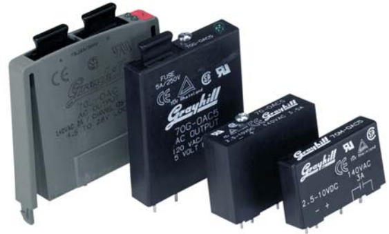
70L-OAC 70G-OAC 70-OAC 70M-OAC