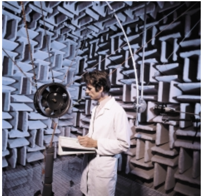
6 sides sound proof chamber

We are equipped to perform noise level tests in our own sound proof chamber. The fan under test is supported on elastic mounts in the center of the test chamber. A microphone is placed 1 meter from the center line of the fan and is connected to instrumentation that includes a measuring amplifier, a condenser microphone, a pass-band filter, and a recorder.