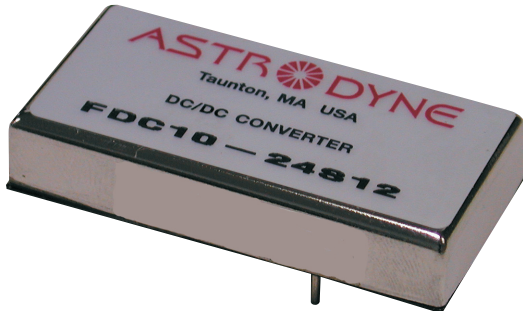
Unit measures 1"W x 2"L x 0.375"H