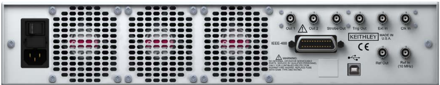
Figure 2. Model 3402-R, Dual-Channel with Rear Outputs

1.888.KEITHLEY (U.S. only) www.keithley.com