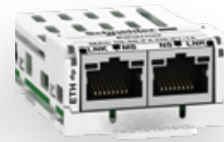
VW3 A3 616