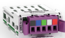
VW3 A3 628