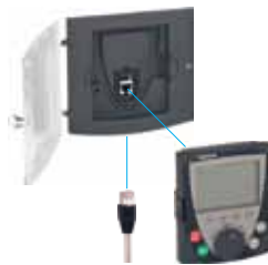
VW3A1102 and VW3A1103