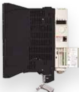
Mounted using VW3A9920