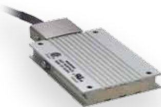
VW3 A7 608 R●●