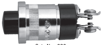
Cat. No. 820