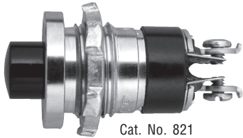
Cat. No. 821