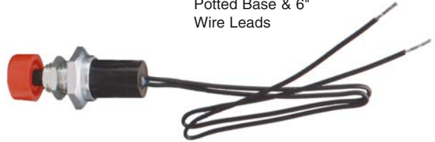
Option -EW, Potted Base & 6" Wire Leads