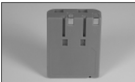
PART NO.: BATT-990 3.6V 600MAH NI-CAD UNIDEN BT990 AND OTHERS