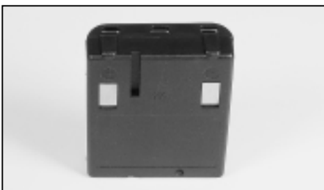
PART NO.: BATT-999 3.6V 600MAH NI-CAD UNIDEN BT-999