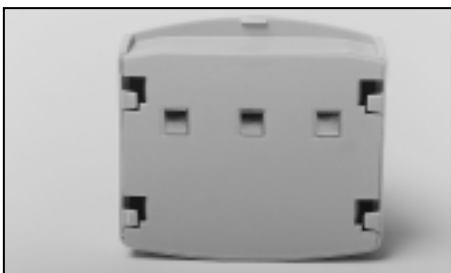
PART NO.: BATT-1916 3.6V 600MAH NI-CAD RADIO SHACK