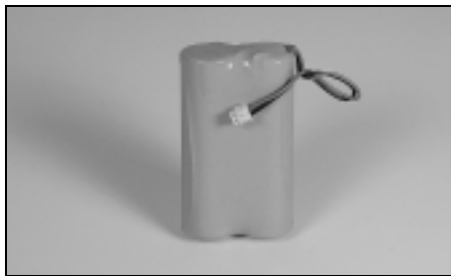
PART NO.: BATT-509 2.4V 1500MAH NI-MH PANASONIC HHR-P509