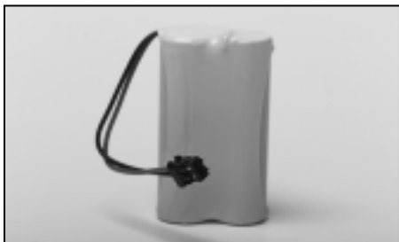
PART NO.: BATT-904 2.4V 600MAH NI-CAD UNIDEN BT-904