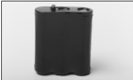
PART NO.: BATT-511 3.6V 900MAH NI-CAD PANASONIC P-P511