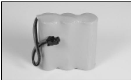
PART NO.: BATT-401 3.6V 1150MAH NI-MH PANASONIC HHR-P401