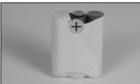
PART NO.: BATT-1421 3.6V 600MAH NI-MH VTECH VT1421 AND OTHERS