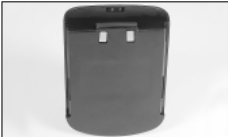
PART NO.: BATT-902 6V 700MAH NI-CAD VTECH 900/950NDL