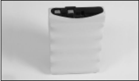
PART NO.: BATT-901 3.6V 600MAH NI-CAD UNIDEN BT-901