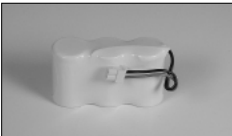
PART NO.: BATT-910 3.6V 600MAH NI-CAD COBRA AND OTHERS