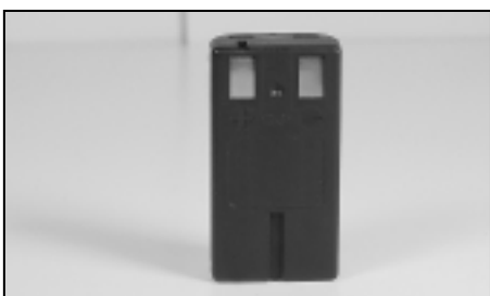
PART NO.: BATT-1000N 2.4V 1500MAH NI-MH PANASONIC KX-TG1000N