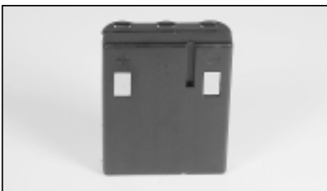
PART NO.: BATT-1711 3.6V 600MAH NI-CAD VTECH 80-4143-00-00