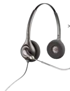
>> SupraPlus Hearing Aid Compatible Wideband Headset