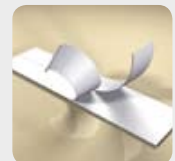
Easy-to-peel split backing

inserts or other applications where adhesive is not required