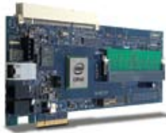
Intel® IQ81342SC Kit