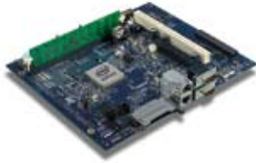
Intel® IQ81342MC Kit