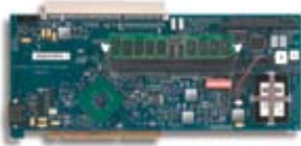
Intel® IQ80331 Kit