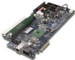
Intel® IQ80333 Kit