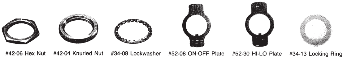
#42-06 Hex Nut #42-04 Knurled Nut #34-08 Lockwasher #52-08 ON-OFF Plate #52-30 HI-LO Plate #34-13 Locking Ring