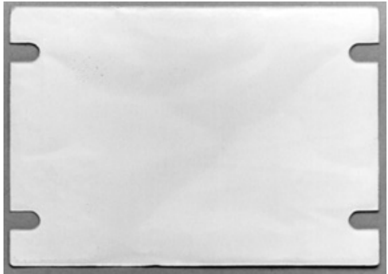
HSP3 Series: Three Phase GN0 and GN3

HSP1 for Single Phase Relay. HSP3 for 3 phase GN0 Series and GN3 Series. Sold in multiples of 25 (1 package) per part number.