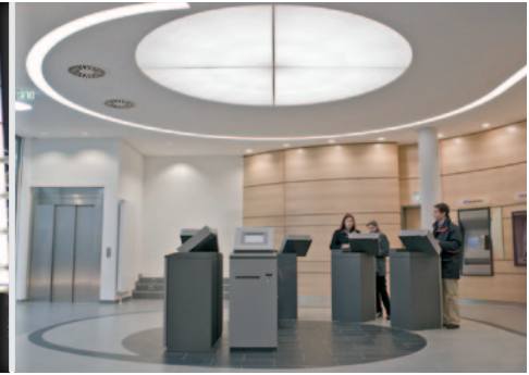
Linear and area lighting