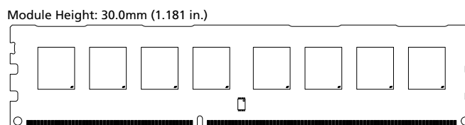
Figure 1: 240-Pin UDIMM (MO-269 R/C B)