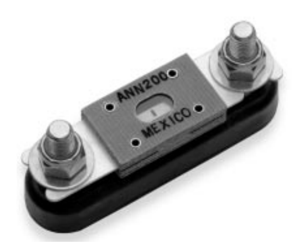
Catalog Symbol: 4164 AND 4164-FR Limiter Fuseblocks 125V