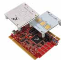
TWRPI Plug-In Starter Kits