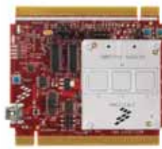
Kinetis Tower System (TWR-K60X256-KIT)