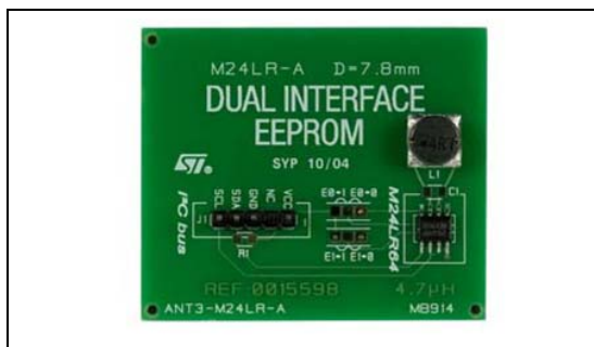
Figure 1. ANT3-M24LR-A block diagram

The reference board Gerber files are available from http://www.st.com .