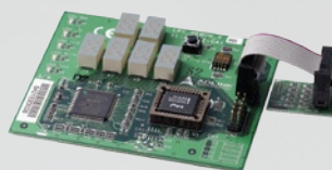
LPC POST Debug Board

Please refer to page 1-46 for detailed information