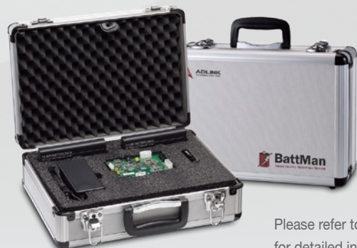
BattMan Smart Battery Management Reference System

Please refer to page 1-45 for detailed information