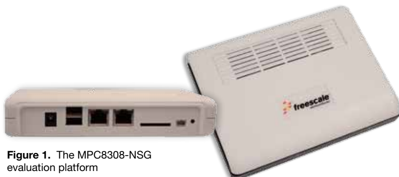
Figure 1. The MPC8308-NSG evaluation platform

The MPC8308-NSG reference design kit includes a complete suite of OpenWRT software that requires no license fees and supports the following applications: GUI that enables Web-based access and management of connected devices and applications, NVR for home surveillance, HD video streaming and ZigBee HAN profiles for Smart Energy 1.0 and Home Automation 1.0. The NSG reference design features a compact 4" x 5" six-layer board and includes a low-cost clamshell enclosure with internal antennas and power supply (shown in Figure 3).