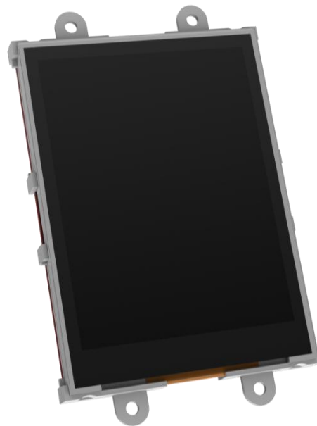
The uLCD-28-PTU Display Module