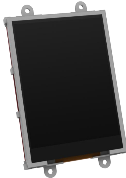
The uLCD-32-PTU Display Module

For a detailed listing of the serial commands available, please refer to the Appendix section of this document.