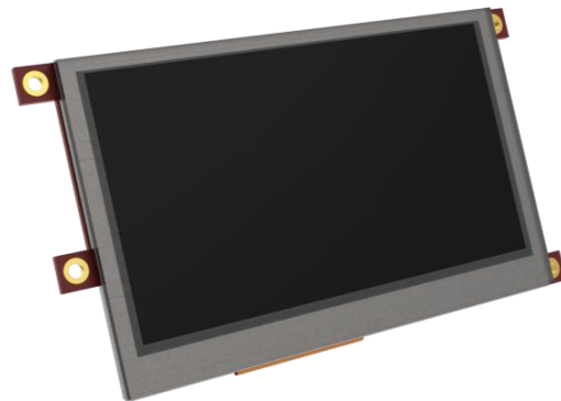
The uLCD-43-PT Display Module