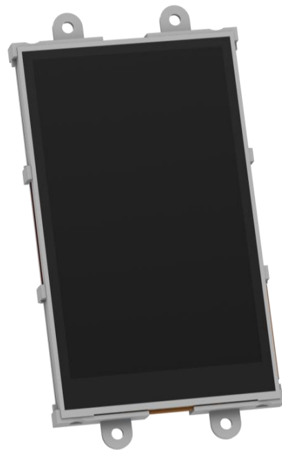
The uLCD-32W-PTU Display Module