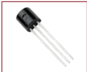
3-Lead TO-92 (N3)