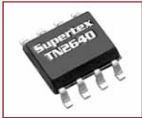
8-Lead SOIC (LG)