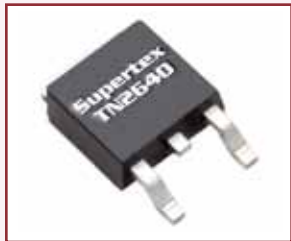
3-Lead TO-252 (K4)