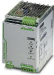
QUINT DC/DC converter, with SFB technology, primary-switched, input: 24 V DC, output: 24 V DC/20 A

Please be informed that the data shown in this PDF Document is generated from our Online Catalog. Please find the complete data in the user's documentation. Our General Terms of Use for Downloads are valid ( http://download.phoenixcontact.com )