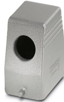
Figure shows product variant with thread.

http://eshop.phoenixcontact.de/phoenix/treeViewClick.do?UID=1678224