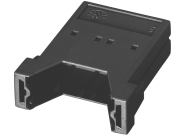
Abbildung stellvertretend für alle verfügbaren Polzahlen.

Subseries Heavy duty connector heavy|mate - C146 M