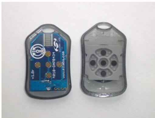
Figure 1. 4010 RKE Universal Key Fob and Plastic Case (P/N 4010-DAPB_434 and MSC-PLPB_1)