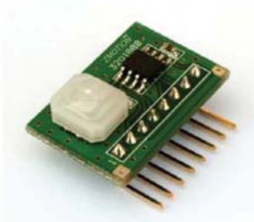
Zilog Part Number ZEPIR0AAS02MODG