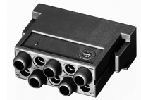
Abbildung stellvertretend für alle verfügbaren Polzahlen.

Subseries Heavy duty connector heavy|mate - C146 M