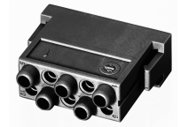
Abbildung stellvertretend für alle verfügbaren Polzahlen.

Subseries Heavy duty connector heavy|mate - C146 M