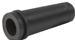
HN 14.45 PVC Strain Relief