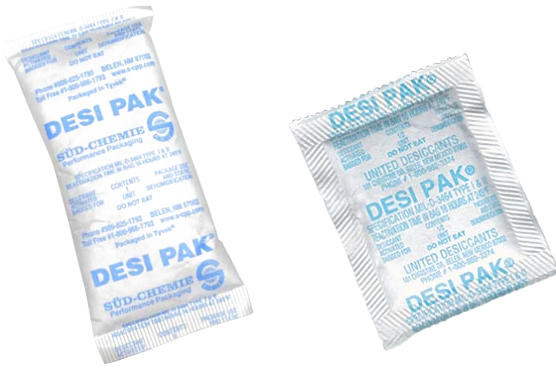
13843 & 13844

In order to provide a complete moisture barrier packaging assembly, desiccant must be inserted into the bag, prior to having the bag vacuum sealed. The recommended amount of desiccant is dependent on the interior surface area of the bag to be used. Figure 4 is a reference table indicating recommended minimum amounts of desiccant that should be used with Moisture Barrier Bags.