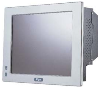
12.1" / 15" / 17" Modularizing View