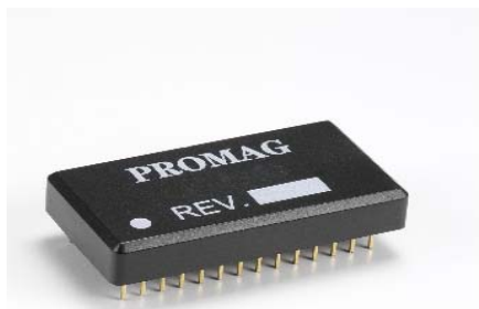
RWM600 Reader Module

※ Specification is subject to change without notice.