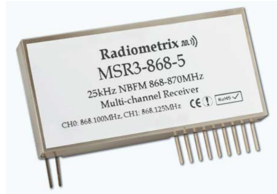
Figure 1: MSR3-868-5 receiver

The MSR3 is a 25kHz channel narrowband receiver intended for European 868MHz band Non-Specific SRD applications. The module offers a low power, reliable data link in an industry-standard pin out and footprint.